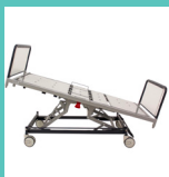
Forward & Reverse Trendelenburg