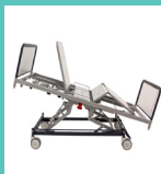
Chair Position Function