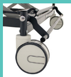
150mm Central Locking Castors