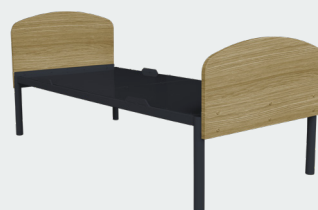
Standard Laminate Natural Oak Standard Powdercoat Ironstone