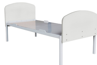
Custom Laminate Oyster Grey Custom Powdercoat APO Grey