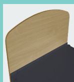
Natural Oak Laminated Endboards