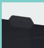
Enclosed Mattress Supports